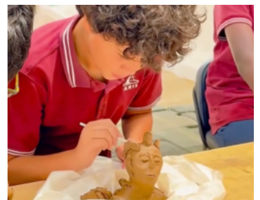
Transforming clay into self-portraits that communicate emotion & personality.