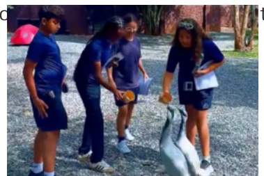
Visit to Safari Eco Park to observe real world ecosystems.

ARIS offers the Pearson BTEC Level 2 Diploma for students who prefer modular assessments. This unique inclusion provides a practical, industry-aligned foundation, embodying our commitment to innovative, career-ready education for Y10 and Y11 students. In addition, it serves as a transition into our senior pathways, the Career-related Programme (IBCP) for the students leaning toward the professional pathway.