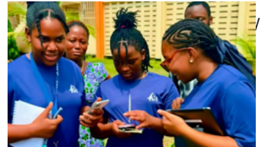
Visit to the Ghana Geological Survey Authority as part of their "Mapping Our World" unit.